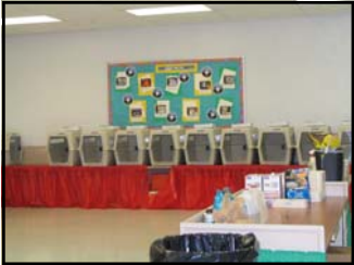
The cat area is located in a classroom. The class prepared the room.

then it's bedtime for the pets. The cat room also can be used to house ferrets and bunnies. This night there was a bird at the shelter. Back across the breezeway was the cafeteria where the Red Cross takes care of the human evacuees. There is a TV and meals. I also got a peek of the equipment room, housed in the girl's locker room. The Humane Society staff keeps their communication radio backup systems there so they can keep in touch across the breezeway during the storm.